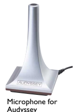
Microphone for Audyssey